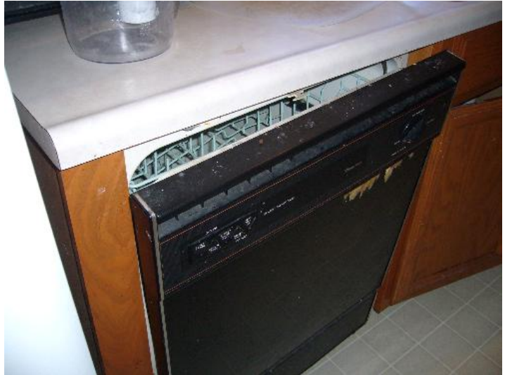
Kitchen appliances not inspected