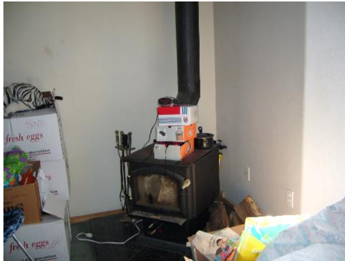
Wood stove in living room - recommend having cleaned and checked by specialist