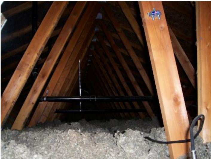
View of attic