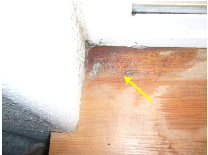
Wet window sills