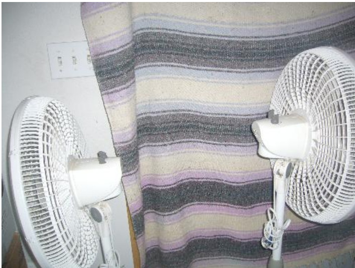
Garage-house door blocked from inside