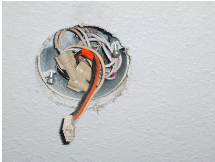
Missing smoke detector in center rear room