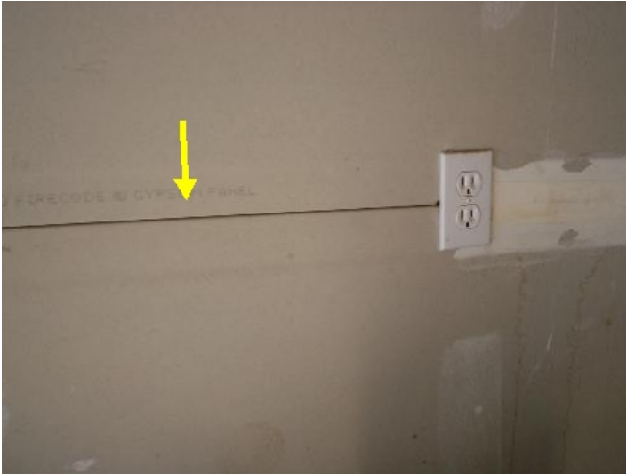
Break in garage firewall