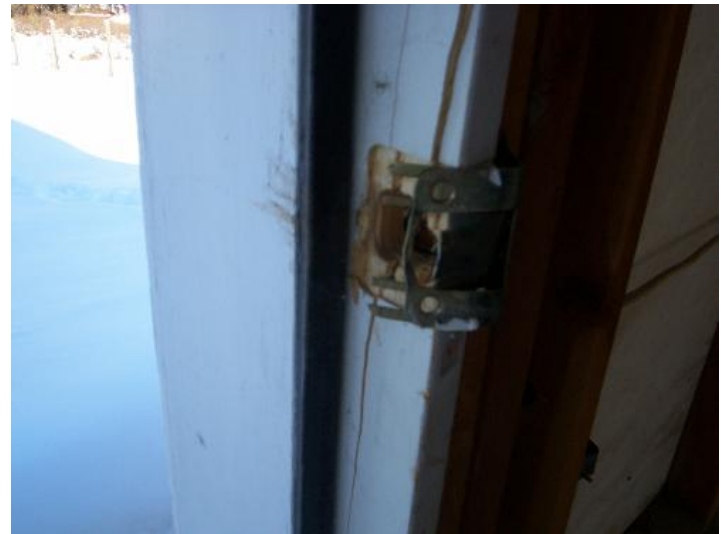
Garage-personnel door frame and striker plate damaged