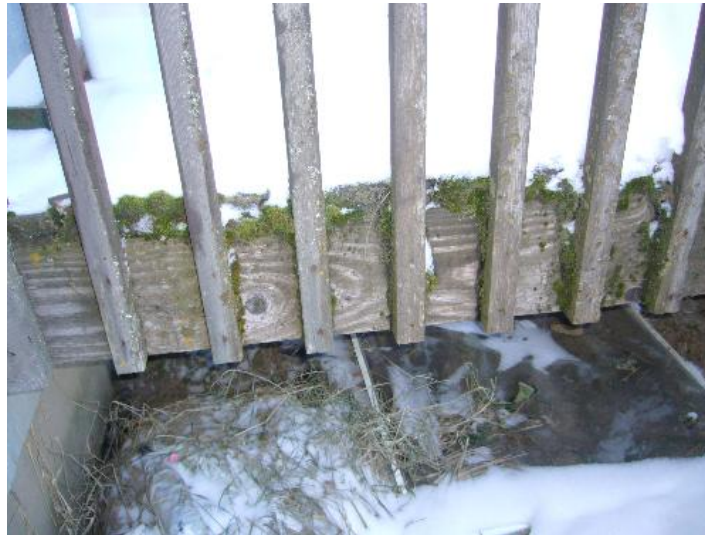
Moss at deck siding - recommend cleaning and sealing deck