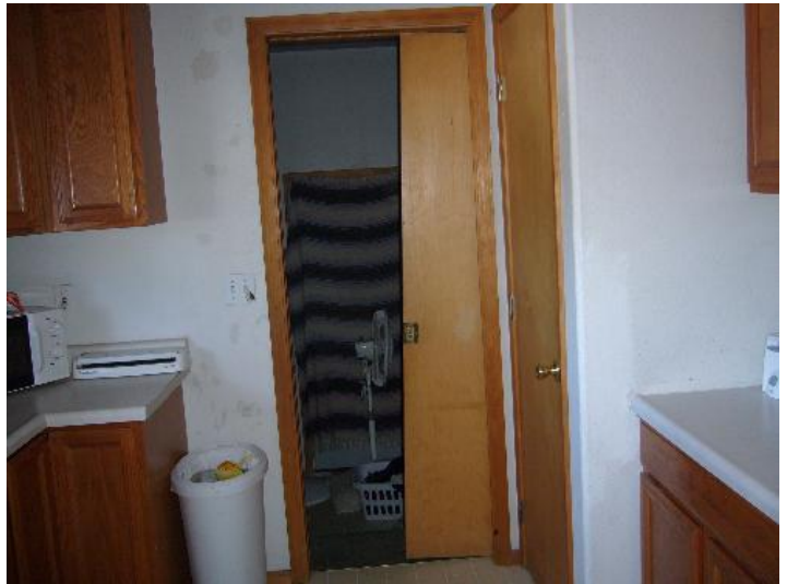
Pocket door between kitchen and laundry room off track/damaged