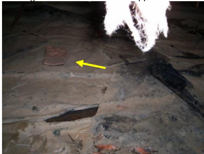
Wood debris at crawlspace floor - Recommend removal