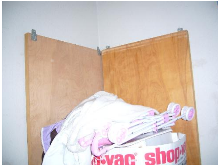
Removed closet doors against bedroom walls