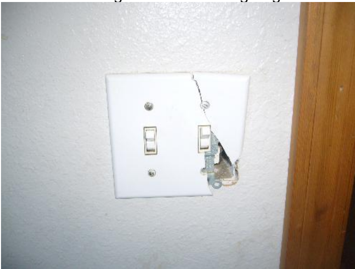
Damaged switch plate in kitchen