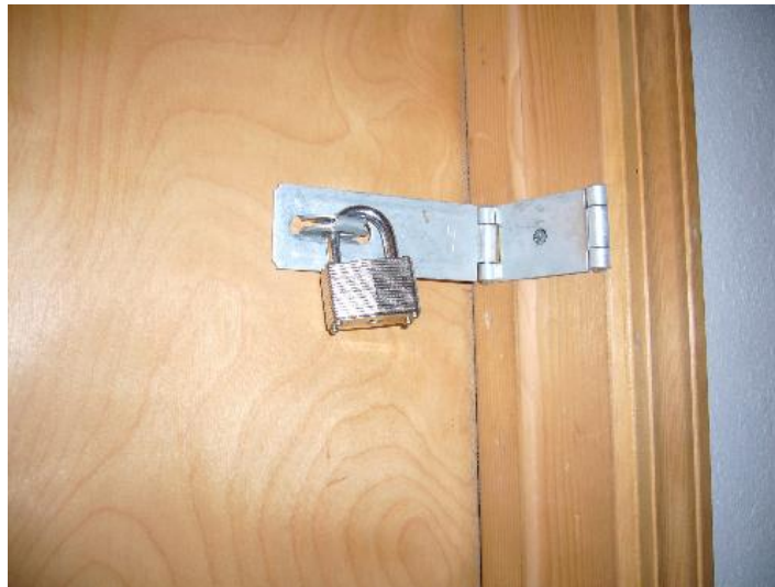
Unable to access master bedroom and master bathroom

Observations: Master bathroom and bedroom not inspected. Door locked with padlock.