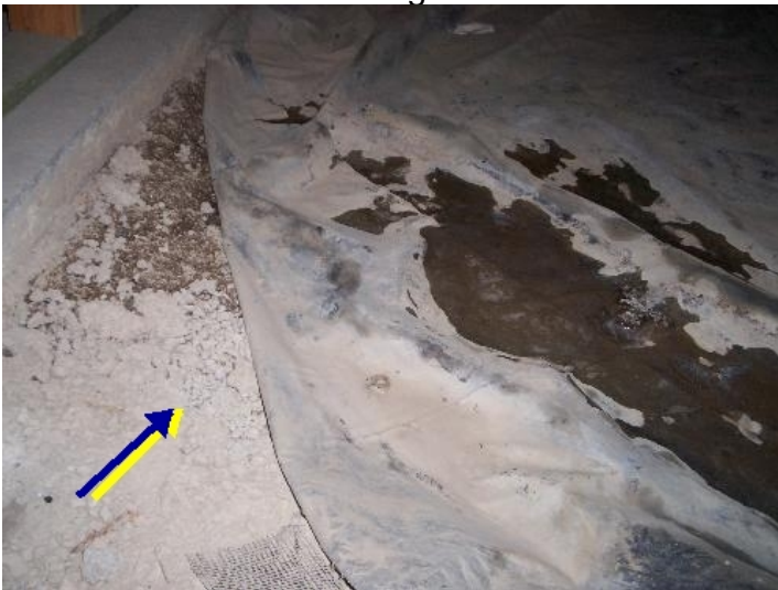
Vapor barrier misaligned