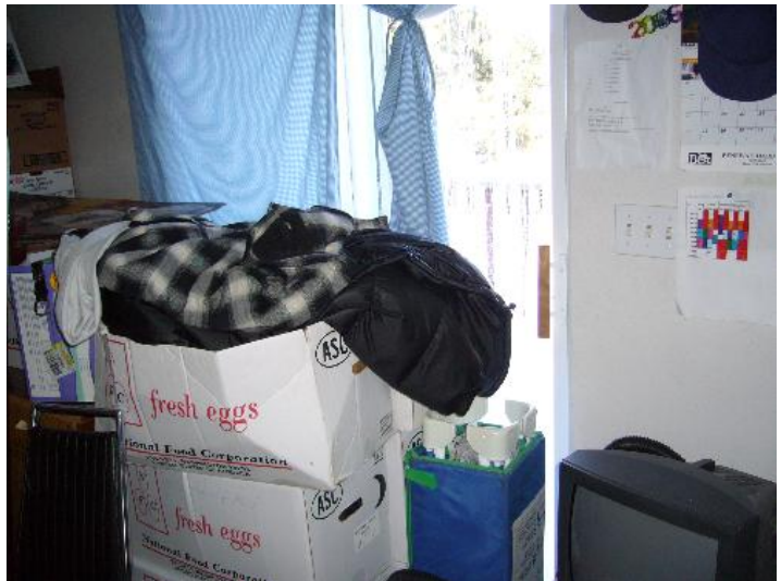
Rear sliding door blocked and appears frozen by ice