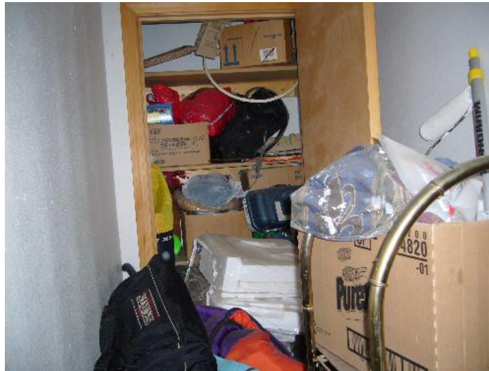
Closet area created at end of hallway - could not be checked