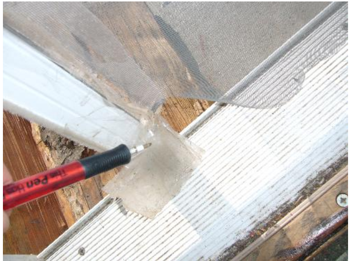
Front door screen damage