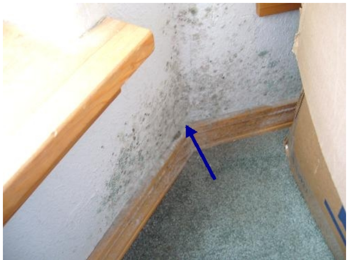
Possible organic substance at bay wall in living room