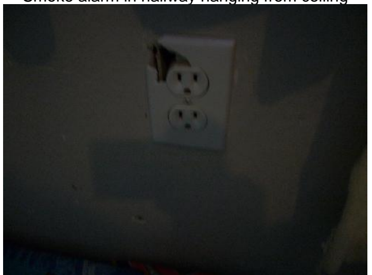
Damaged outlet cover