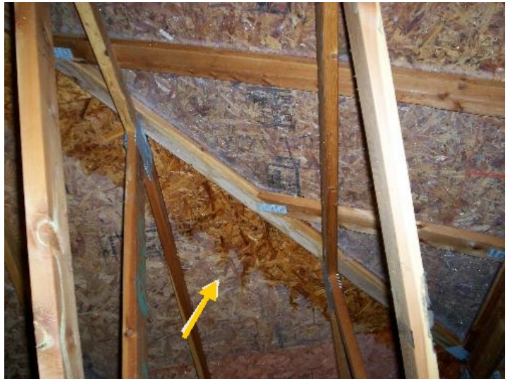
Moisture from condensation in attic