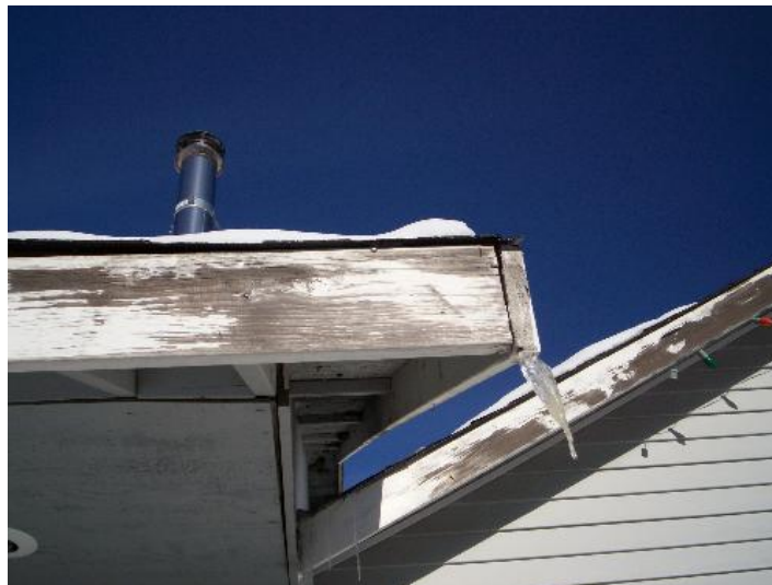
Slope-wall style roof