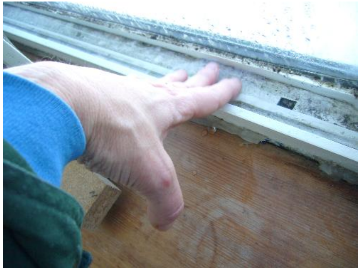
Water standing in window tracks, not draining