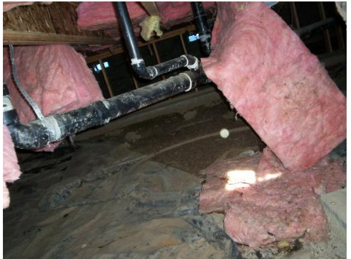
View of crawlspace - fallen insulation