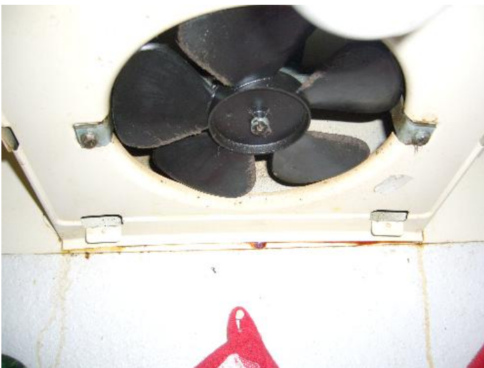
Fan cover missing over stove