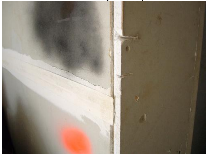
Tape and seal corner also for continuous firewall