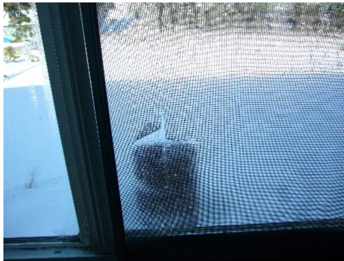
Window screen damage