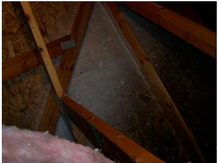
Excessive condensation in attic