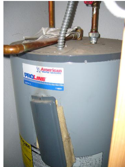
View of water heater - control cover missing screws