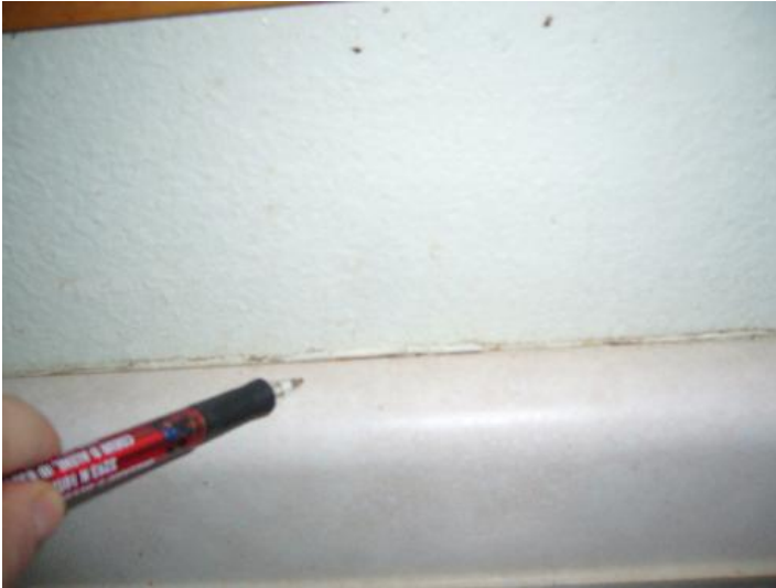
Minor caulk needed at sink backsplash