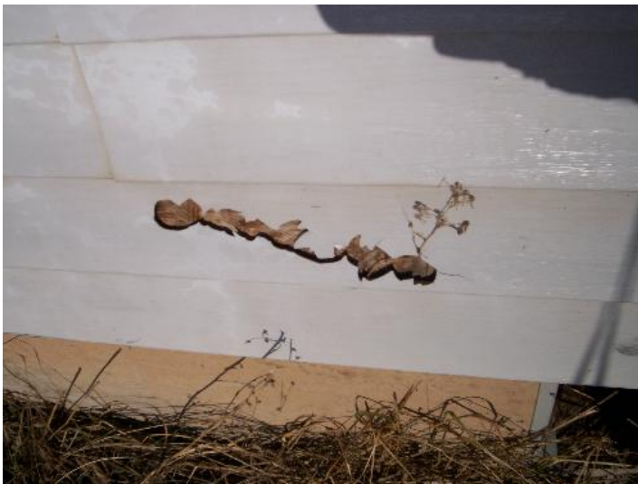
Damage to vinyl siding