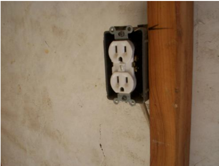
Missing outlet covers in garage