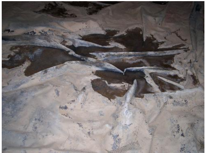
Water appears to be sitting on top of vapor barrier