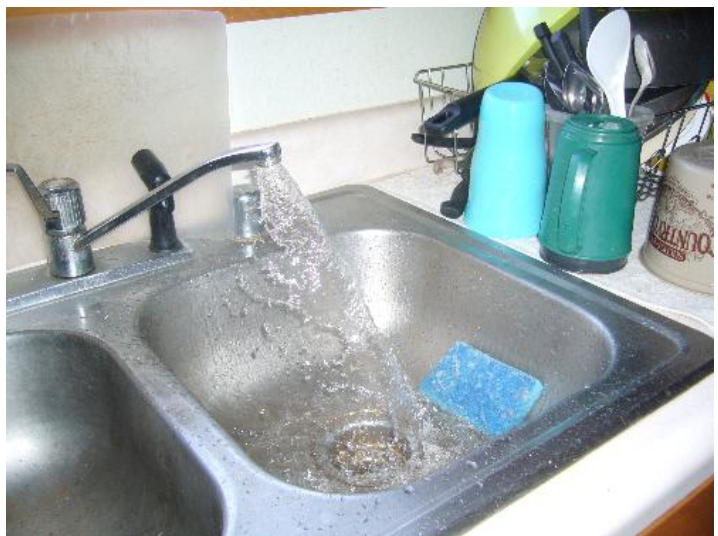
Sink faucet needs aerator