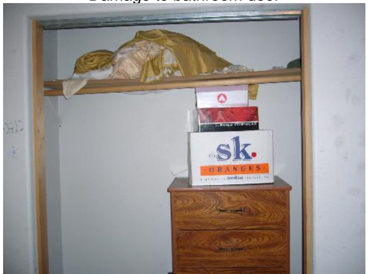
Closet doors removed in both rear bedrooms