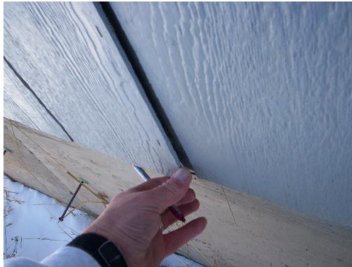
Some composition siding panels need resecuring