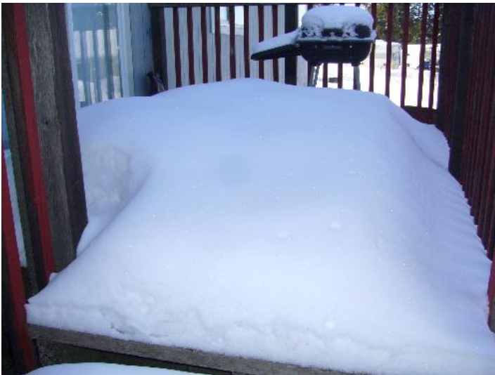
Deck snow covered and could not be inspected