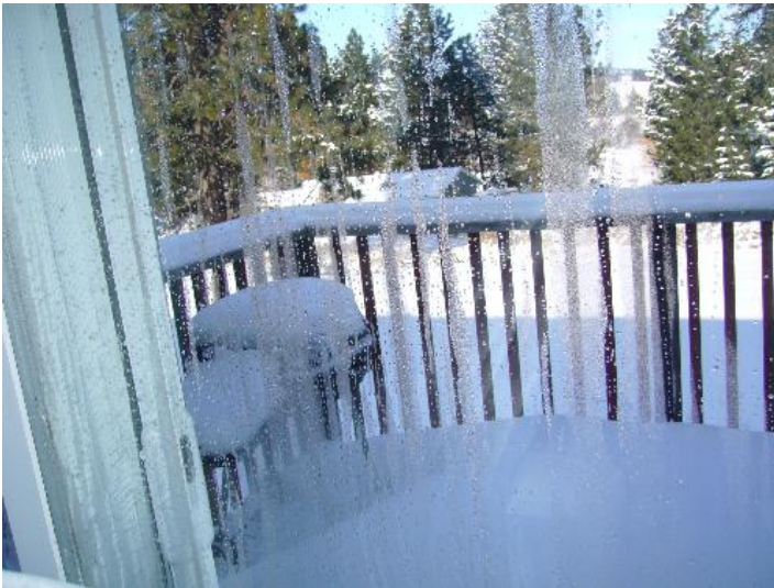
Screens at front and rear doors damaged-- Excessive condensation at all windows