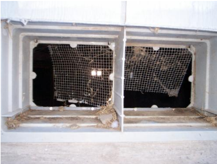
Several crawl vent screens missing and/or damaged