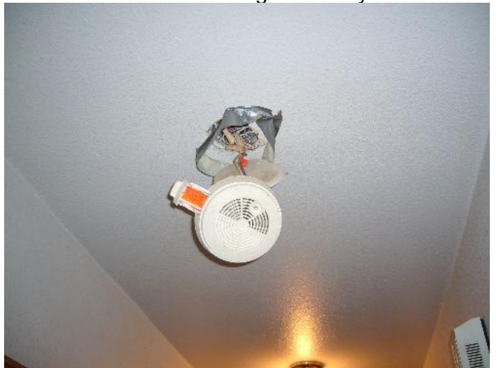
Smoke alarm in hallway hanging from ceiling