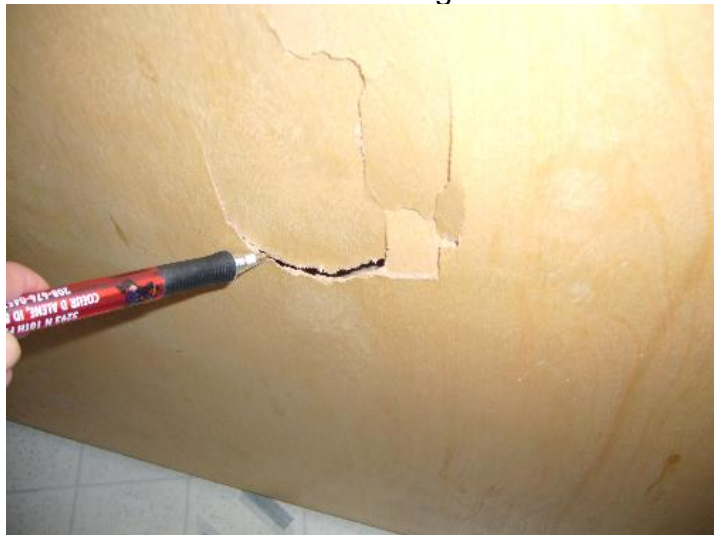
Damage to bathroom door