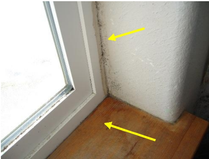
Wet window sills due to condensation - caulk when dried