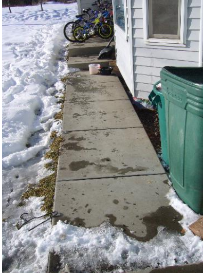
Walkway slightly slopes toward house