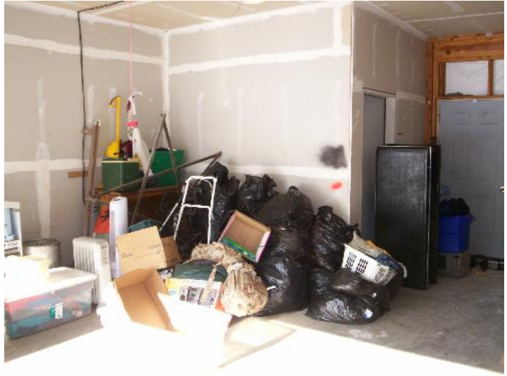
Several areas obscured by stored/personal items