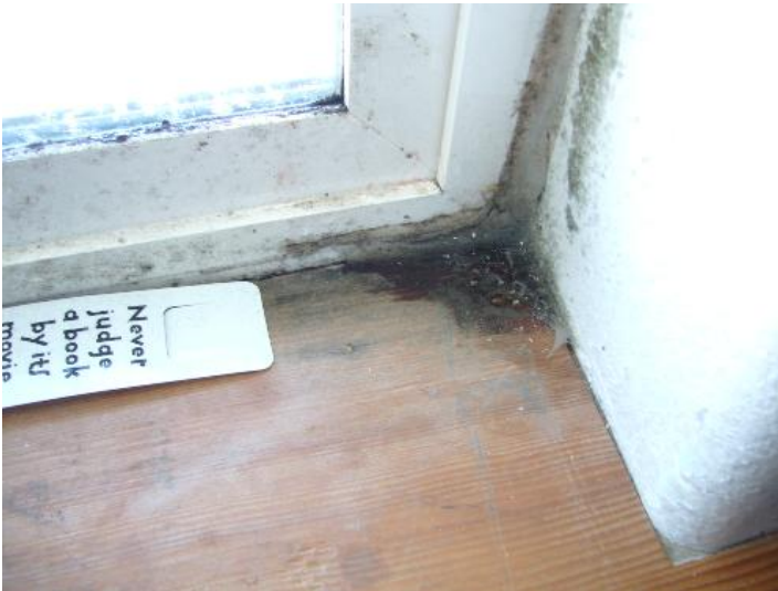
Possible organic substance at left rear bedroom window