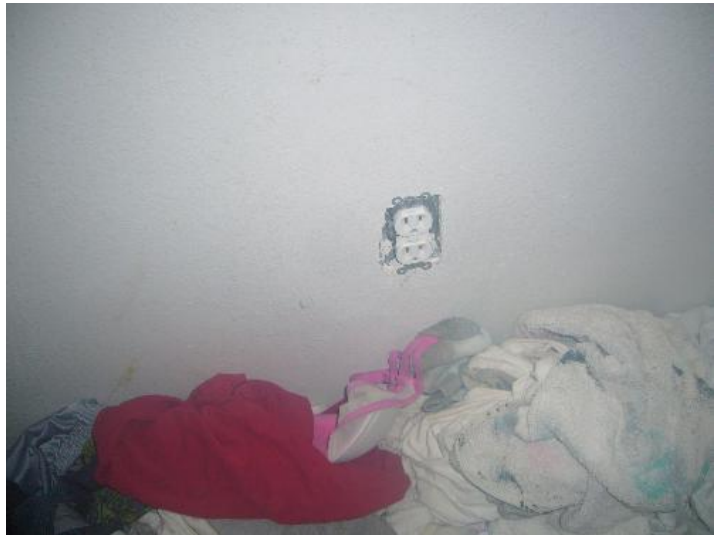
Outlet cover missing in laundry room