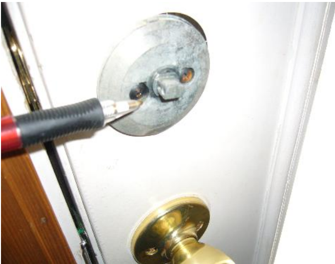
Front door dead bolt latch broken