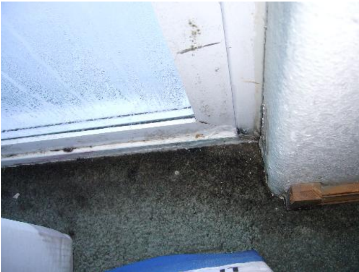
Wet area at rear sliding door from ice/condensation