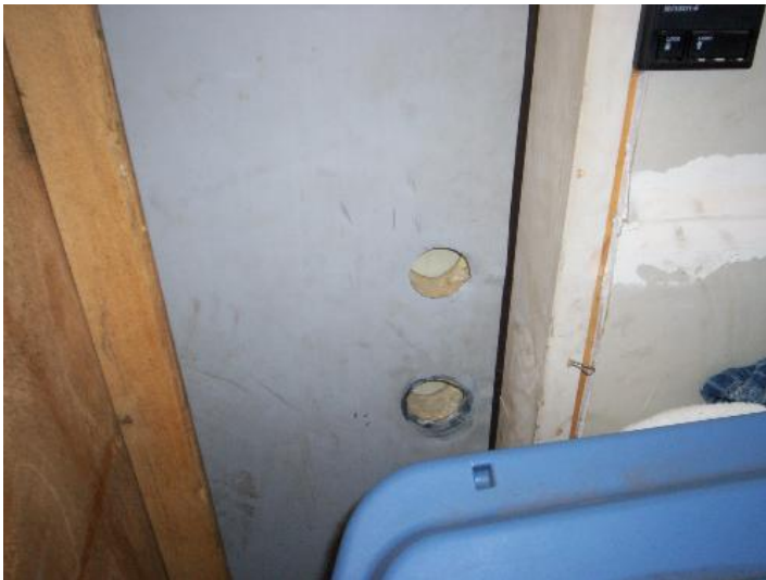
Garage-house door blocked and hardware missing