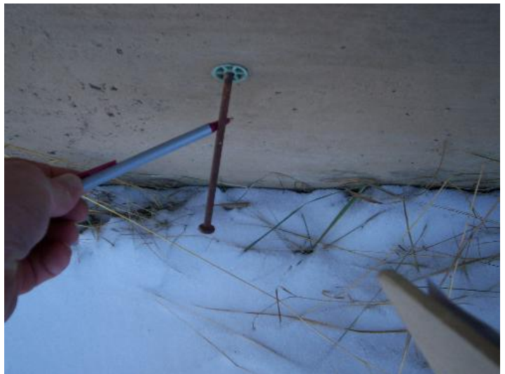
Cut form nails flush with foundation