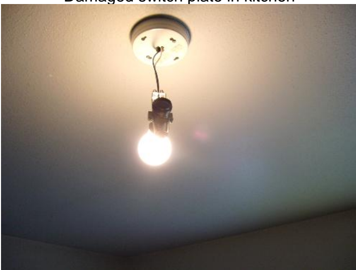
Several light fixture covers missing and light hanging from ceiling in left rear bedroom