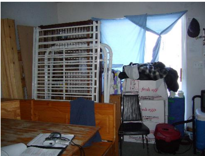
Numerous walls & floors obscured