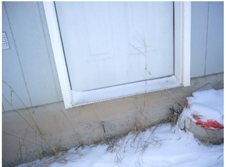
no steps at garage-personal door at rear of house