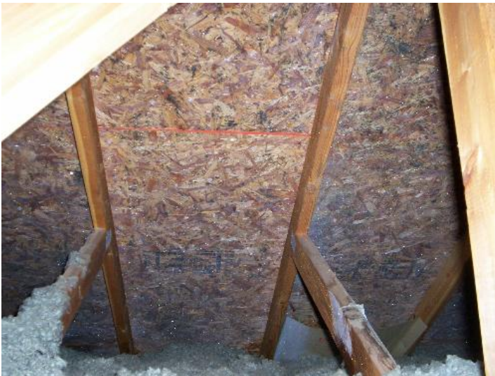
Ice crystals at attic sheathing from condensation